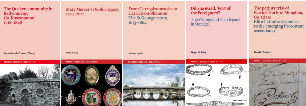
No. 166 Co. Roscommon

Below are images of five of the six volumes, see page 2 for No. 171, Co. Kildare.