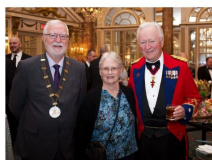
Cumann Genealais na hÉireann www.familyhistory.ie Journal of the Genealogical Society of Ireland